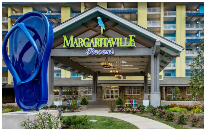
Margaritaville Resort Gatlinburg, Tennessee